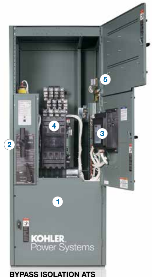
BYPASS ISOLATION ATS