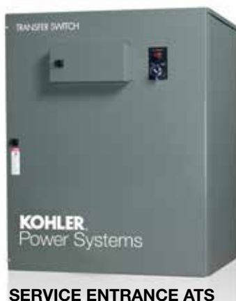
SERVICE ENTRANCE ATS

Anti-condensation heater, voltage surge suppressor, line-to-neutral voltage monitoring, seismic certification and more